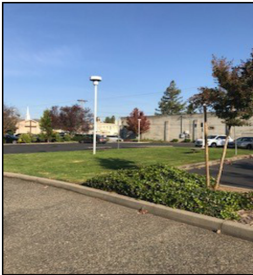
Figure 1 - Art Piece will be located in lawn area

The art piece should be placed on an appropriate base that meets all city codes and engineering requirements and will fit within the grassed area.